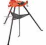
460-12 TRISTAND® VISE