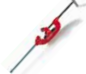
S-6 HD PIPE CUTTER