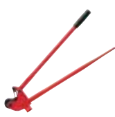
1390M ROD CUTTER