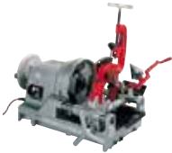
1233 THREADING MACHINE