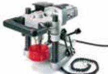
HC-450 HOLE CUTTER