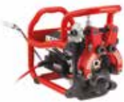
B-500 PIPE BEVELLER