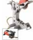
258-XL POWER PIPE CUTTER